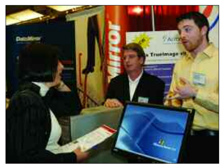
The 2006 free show and conference assembled buyers and sellers in a friendly environment at the Metropolitan Pavilion. The Metropolitan Pavilion is exhibitor friendly and has become a major meeting place for Wall Street and New York business, convenient to restaurants, hotel and chic shopping in the heart of Chelsea, New York.