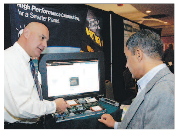
"We found the Show useful. Hold a space for us in 2015."

Other sponsorship opportunities will be considered. Contact Flagg Management.