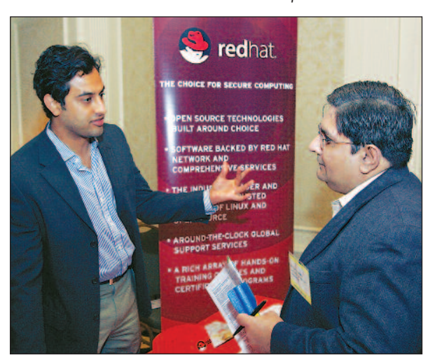
"Well organized show. We want to continue in this market next year."