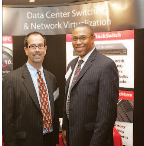
Data Center Switches and Network Virtualization are of major concern for Wall Street.