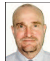
Bishop Brock Research Staff, IBM Research