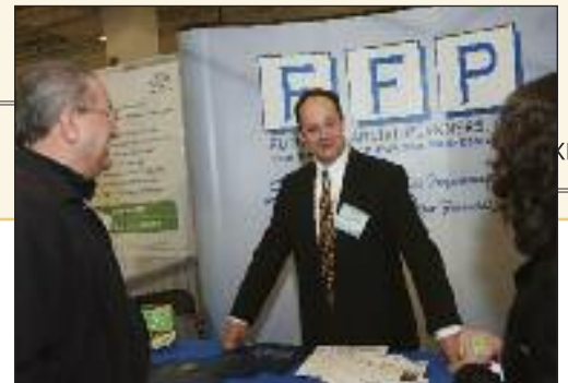
Financial and business services are vital services to CPAs attending the Show.