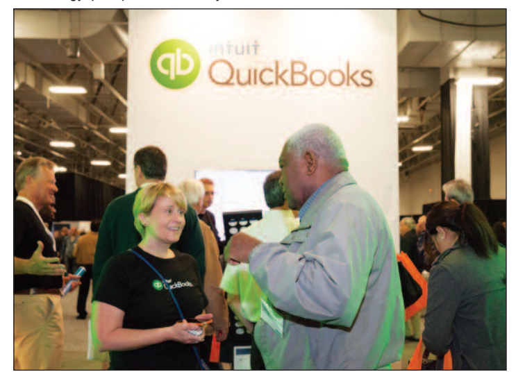
Exhibitors will give live demonstrations of their latest accounting, business, financial systems, technology. NEW- Attend QuickBooks Academy in 2015.