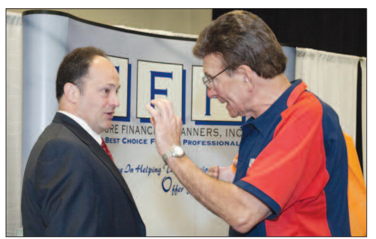
See, examine, and learn about new products and services to improve your accounting practice and your client operations.