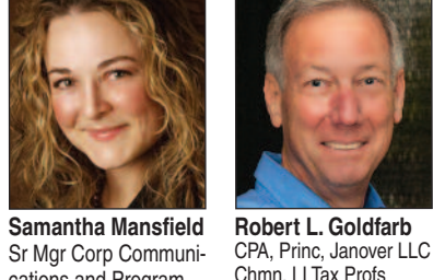
cations and Program Devel, CPA.com