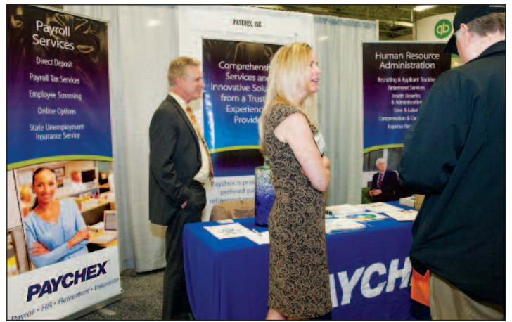
Informative exhibitors will show new systems live on the show floor, with knowledgeable experts to explain and show how to use these systems in your practice.