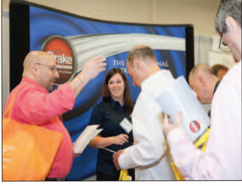
Face-to-face contact will save months of looking for person-to-person know-how from your vendors. They're coming to see you.

RMR Wealth Builders. Div Calton & Associates Sage The Tax Adviser Taxpayer Advocate Services, Thomson Reuters Div of IRS Thomson Reuters Total Cover IT TPS Software Inc. Willis of Delaware Wolters Kluwer Xtel Communications, Inc. ZenPayroll