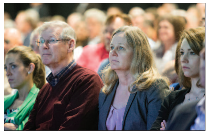
CPE is free each morning from 8-9:40 am with 2 CPE credits. The whole day CPE is only $45 with 6 CPE credits, plus the Show and morning coffee service.