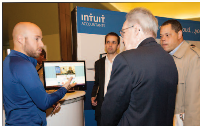
Face-to-face contact will save months of looking for person-to-person-know-how from your vendors. They're coming to see you.

Association Sponsor Greater New York Chamber of Commerce