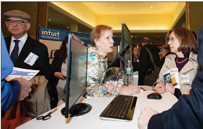
See, examine, and learn about new products and services to improve your accounting practice and your client operations.