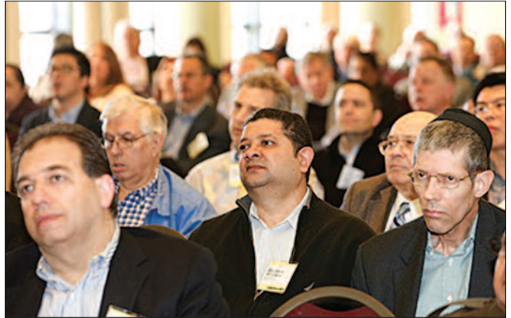
Informative exhibitors will show new systems live on the show floor, with knowledgeable experts to explain and show how to use these systems in your practice.