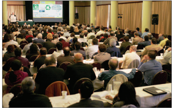
CPE is free each morning from 8-9:40 am with 2 CPE credits. The whole day CPE is only $45 with 6 CPE credits, plus the Show and morning coffee service.