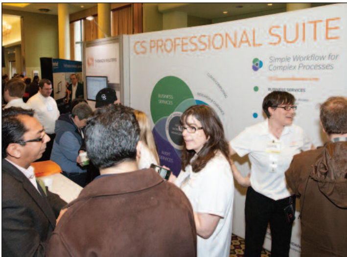
Exhibitors will give live demonstrations of their latest accounting, business, financial systems, technology.