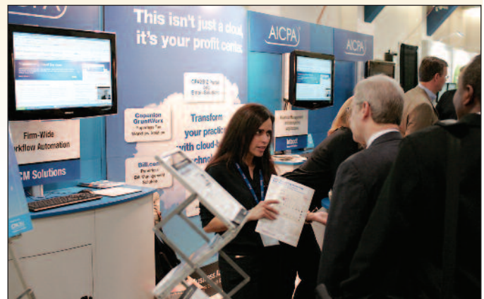
Face-to-face contact will save months of looking for technical and operational know-how from your vendors. They are there to see you.

The 5th Annual 2013 Accounting Technology Show, May 1-2 Your best investment to jump-start your accounting practice with iPads, iPhones, Internet, Smart Systems for finance, banking and accounting.