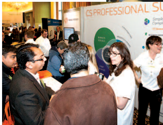
Person-to-person marketing provides the Show's exhibitors an opportunity to demonstrate and sell to a captive audience.

Booth rental fee is $2,500 per booth. Over 1,200 accounting professionals will be there to see you.