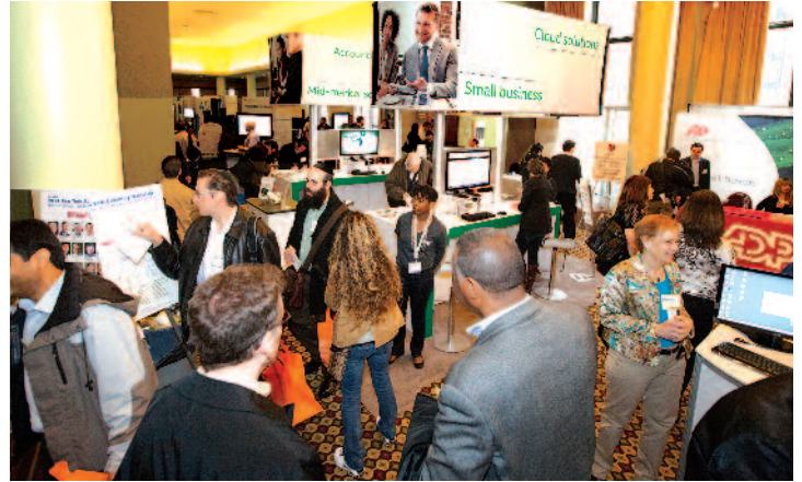
The accredited New York State CPE program draws accounting professionals from midtown, Long Island and upstate New York.

A COMPLETE PACKAGE OF SERVICES IS INCLUDED IN THE BOOTH RENTAL. Pre-Show services include free invitations to invite your customers and prospects, listing in the Pre-Conference promotional brochure, Website and email promotions and Web-site listing. Crosslinking with your company's Website, free downloading of VIP email invitations to your customers and prospects. At-Show services include complete decoration services: curtain backwall, booth carpeting, side dividers, draped table, chairs, sign, waste basket, and free Show Directory listing. Post-Show services include Show attendee names and addresses in electronic file format.