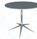
A - 30" High