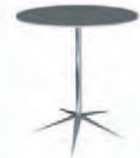
B - 42" High