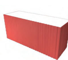
30" Draped Table

RENTAL PRICE INCLUDES DELIVERY TO & REMOVAL FROM BOOTH.