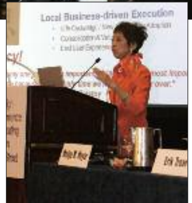
Wall Street IT speakers and Gold Sponsors will lead drill-down sessions in the Grand Ballroom program.

Exhibit space for both these events will include a complete package of services. Booth rental will be at $4k. See the complete package of services inside.