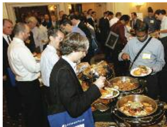
"The luncheon program provided an enjoyable break to meet some of my colleagues from Wall Street."