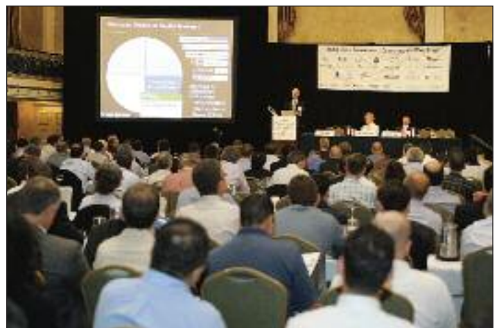
Gold Sponsors combine with Wall Street IT speakers for a major program of financial markets experience sharing.