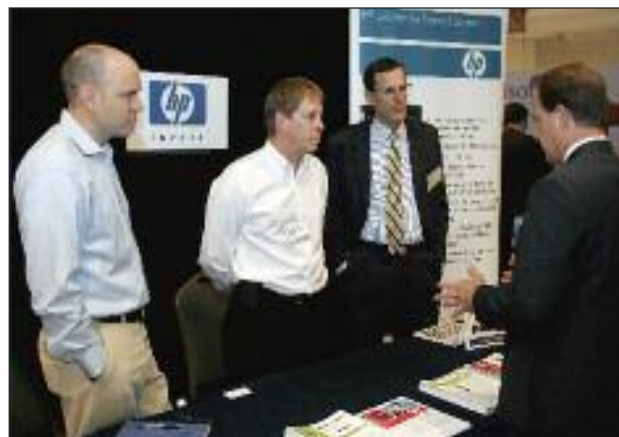
"We found the Show useful. Hold a space for us in 2010."