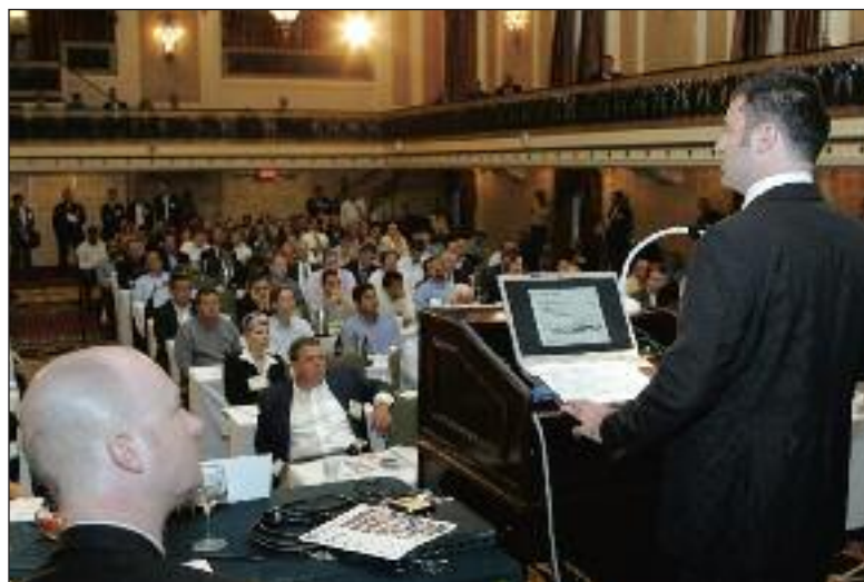
"The conference was an opportunity to hear from the top players in the HPC arena."

Inside back cover, 7x10", 4-color – $5,000