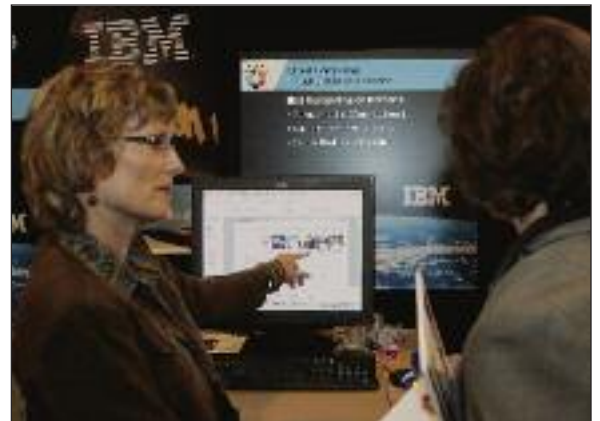
Exhibitors have a captive audience of high level Wall Street IT directors.

If you have products for Wall Street join us.