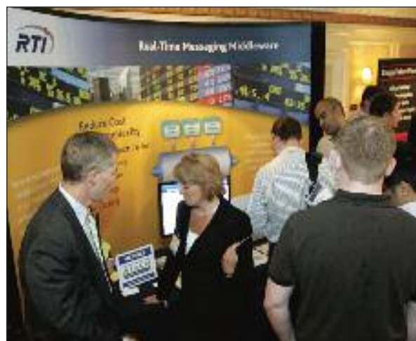
"Well organized show. We want to continue in this market next year."