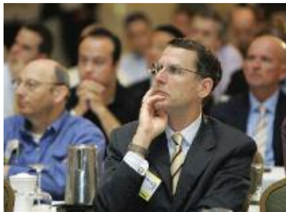
"The conference program was worthwhile and covered some issues I needed to know."