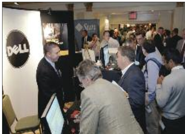
"A compact one-day program with exclusive show viewing times."

Speaking is at the Gold Sponsorship level at $15k.